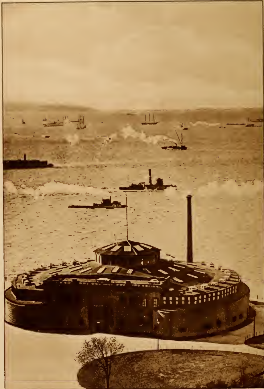
A VIEW OF NEW YORK HARBOR, showing the historic Aquarium. The view of the Harbor from this spot is most impressive.